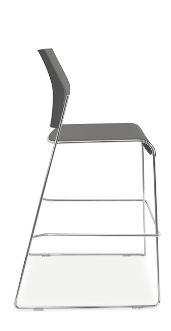
TUCK COUNTER STOOL IN SMOKE POLYPROPYLENE AND CHROME FRAME FINISH. AVAILABLE WITH 4-LEG OR SLED BASE.

The Tuck series includes a range of heights, frame designs and upholstery options. All are available in 11 polypropylene options and 12 frame colors that can be mixed and matched to create dynamic environments.