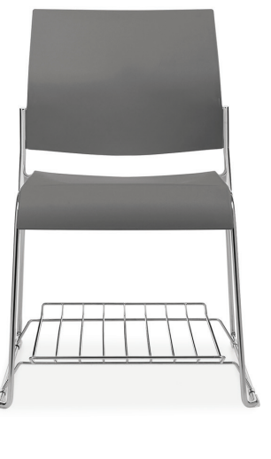
TUCK SLED IN SMOKE POLYPROPYL-ENE AND CHROME FRAME FINISH WITH STORAGE TRAY.