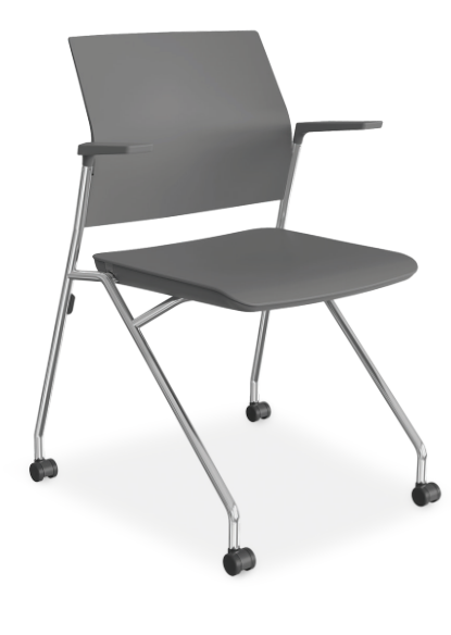
TUCK NESTER IN SMOKE POLYPROPYLENE AND CHROME FRAME FINISH.