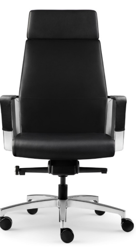
REQUISITE HIGHBACK, ARMS WITH WRAP, KNEE TILT MECHANISM, ALUMINUM