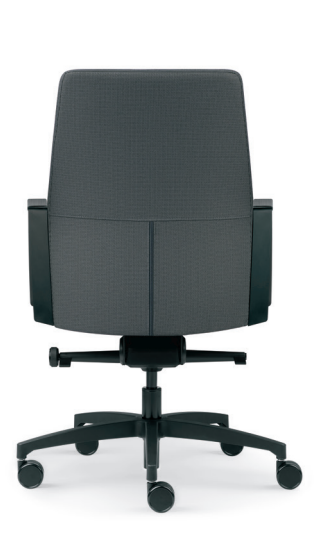
REQUISITE MIDBACK, BLACK PAINTED ALUMINUM LOOP ARM, KNEE TILT MECHANISM, BLACK NYLON BASE.

A highly durable all-steel frame allows the back to flex to support lengthier conversations and a more comfortable sitting experience. Choose a synchro-tilt mechanism that simultaneously tilts as you lean back, or a knee tilt mechanism to provide the maximum recline. In keeping with our commitment to providing solid ergonomic solutions, adjustments can be made conveniently from the seated position. Design options include polished aluminum, smoke and black frame finishes, three arm styles, two back heights and two mechanisms in order to tailor Requisite to your specific needs.