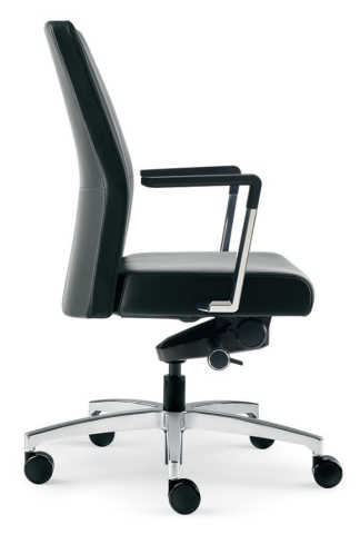
REQUISITE MIDBACK, BLACK 7-ARMS, SYNCHRO TILT MECHANISM, ALUMINUM BASE.